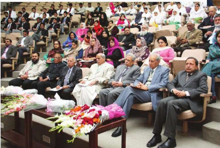
Prize distribution ceremony of Project Professionalism Punjab (March 6).