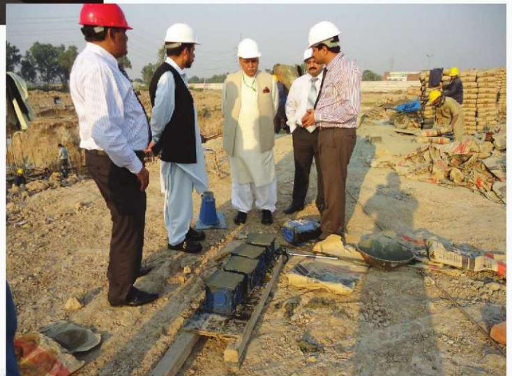
Construction work is at full swing at Kala Shah Kaku Campus.