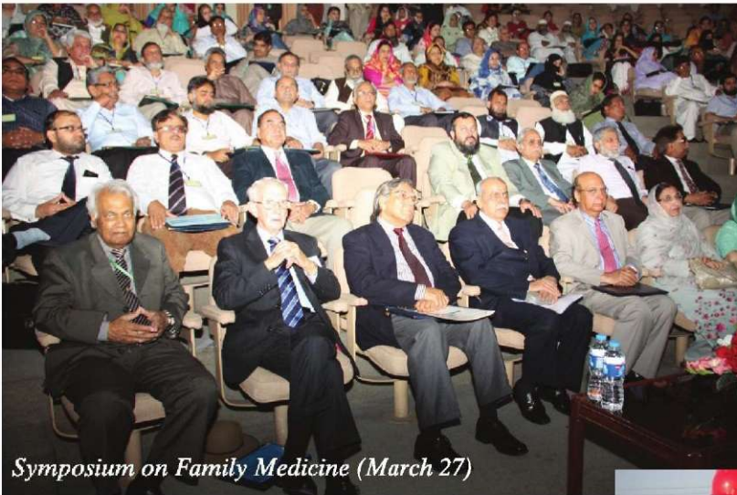
Symposium on Family Medicine (March 27)