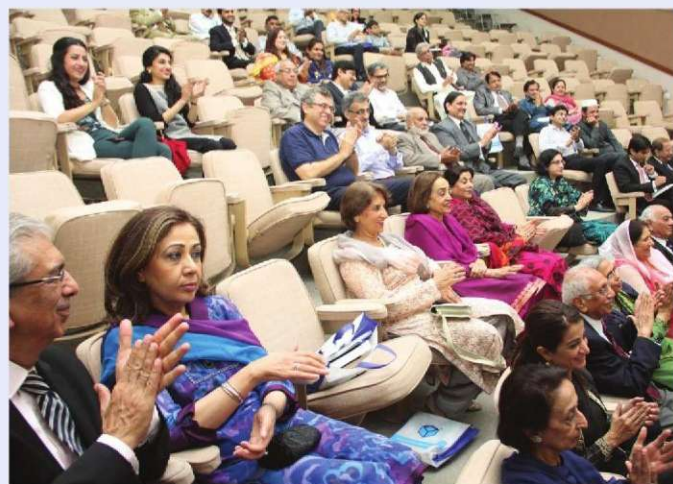
A large number of eminent surgeons and academicians attended the ceremony.